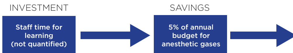
POTENTIAL, SCALED TO ALL HOSPITALS IN STATE